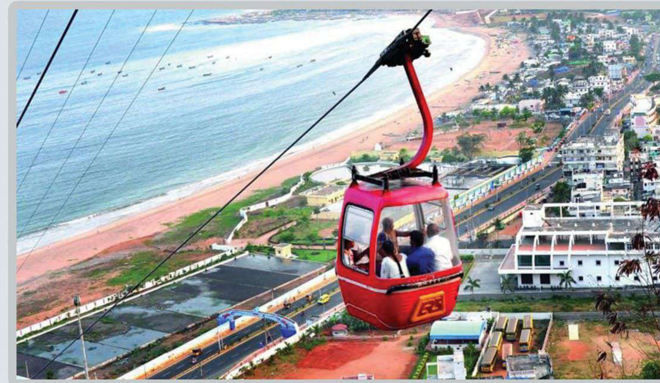
Kailash Hills Rope-way