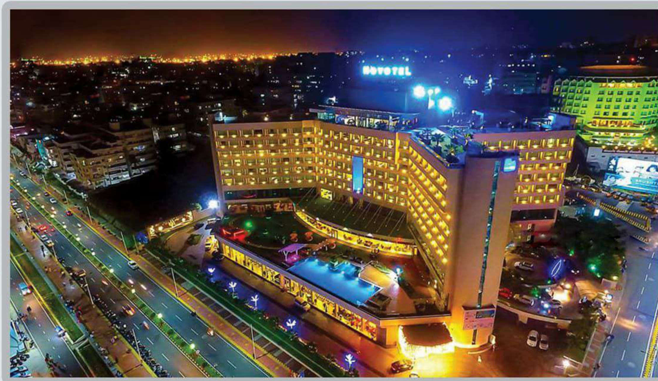
RK Beach Night View

to anticipate every need of it's residents with utmost detailing, care and due respect to your privacy.